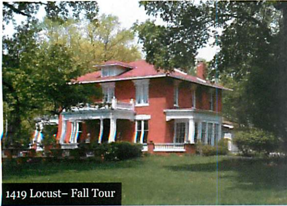
1419 Locust- Fall Tour